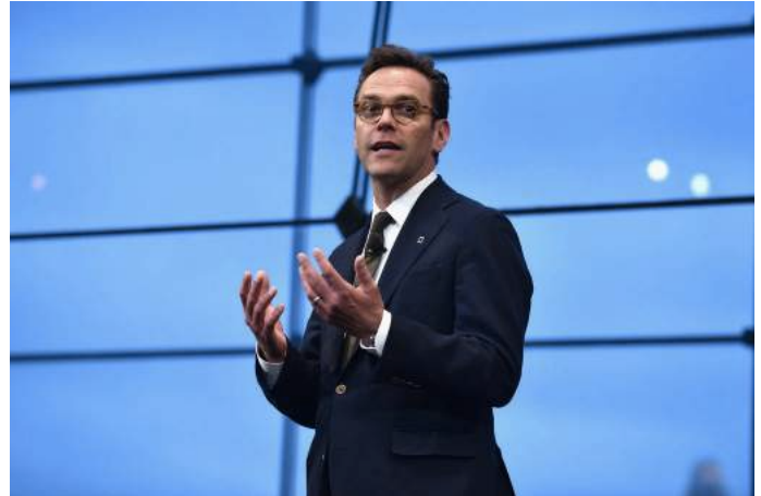
Bryan Bedder/Getty Images/National Geographic